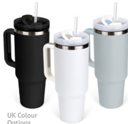
UK Colour Options