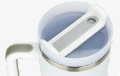
All Over Engraving (Far East)