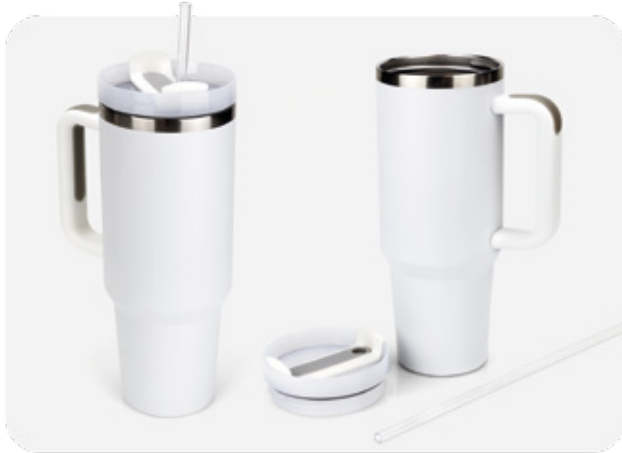
Two Ways of Drinking