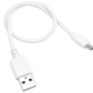
Charging cable Micro-USB cable