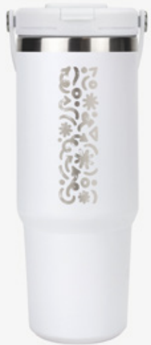
Leak-Proof Screw Lid for easy cleaning and adding ice