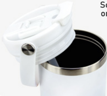
Screw on Lid