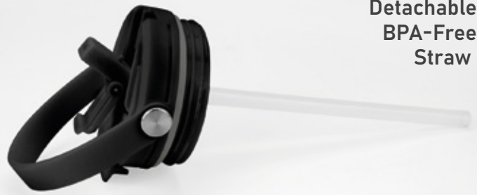
Detachable BPA-Free Straw