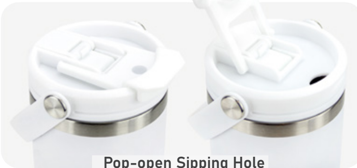
Pop-open Sipping Hole