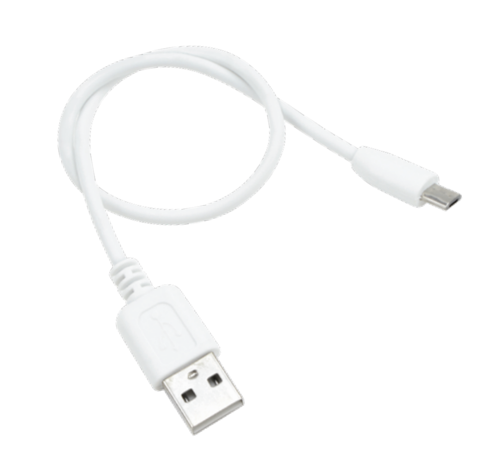
Charging cable Micro-USB cable *Cable model may vary