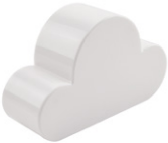
Magnetic Key Holder