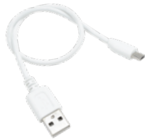
Charging cable Micro-USB cable *Cable model may vary