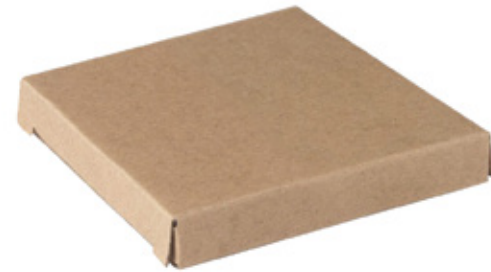
Product packaging Unbranded card box